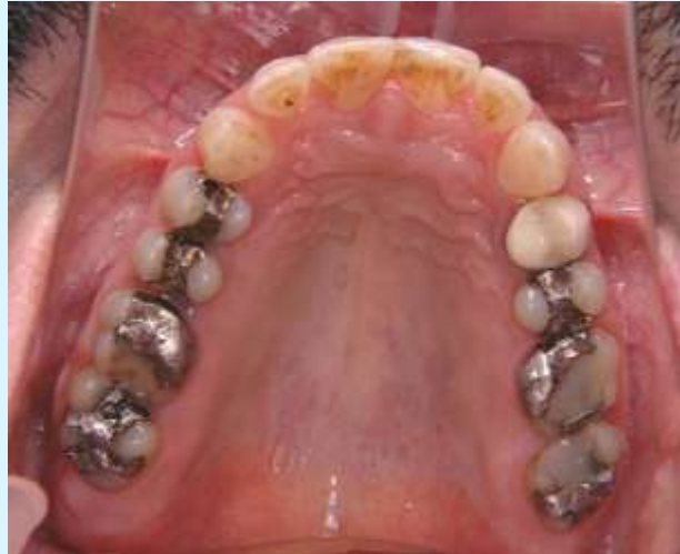
After KFO and restoration 2014-12-10