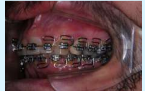
MEAW-Arch in the lower jaw