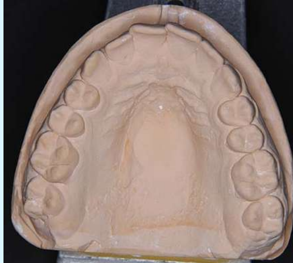
After FKO 2005-08