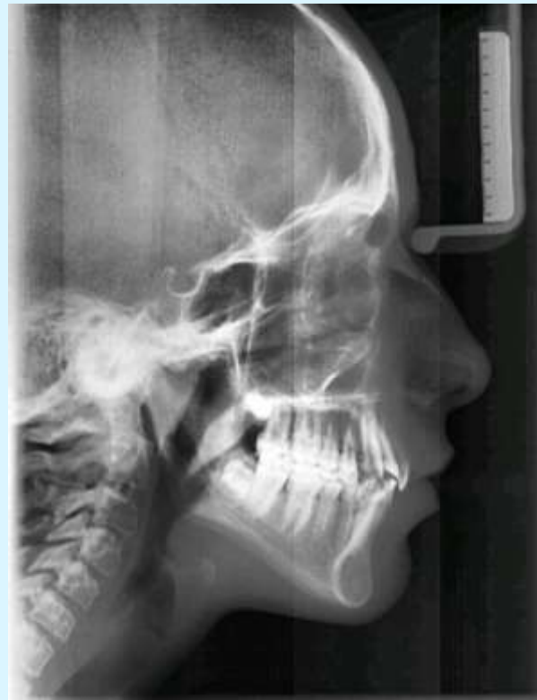
2005-08 after FKO