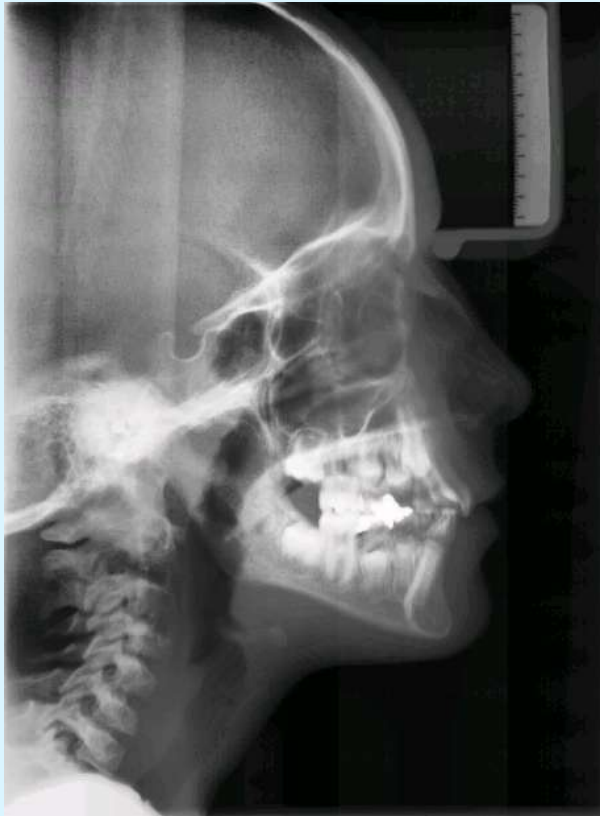
2001-01 before FKO