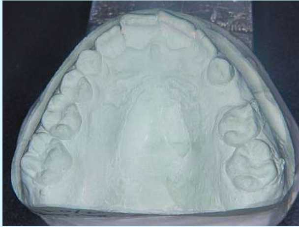
Before FKO 2001-01