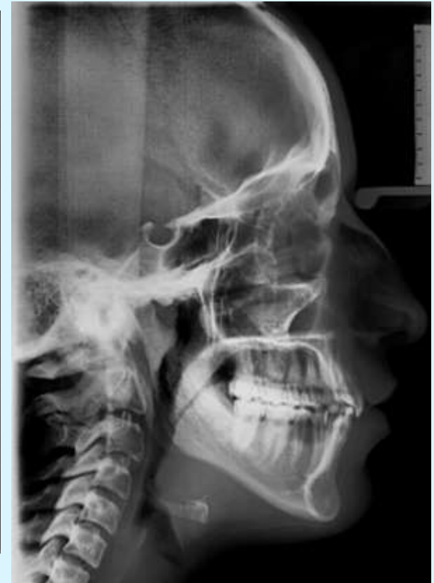
2009-10 after Extraction of all wisdoms note the ant. closing Rotation of the mandibel → the old FKO-Appliance (EOA) is still working, only at night