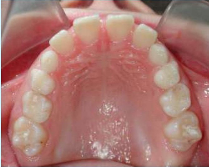
2004-08 before FKO